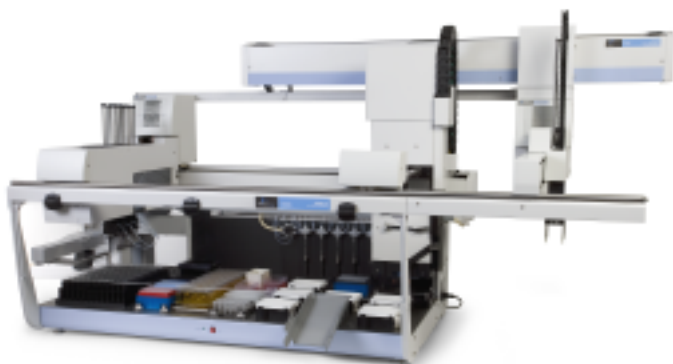
Figure 1. JANUS Varispan + MDT w/Gripper Integration Platform.